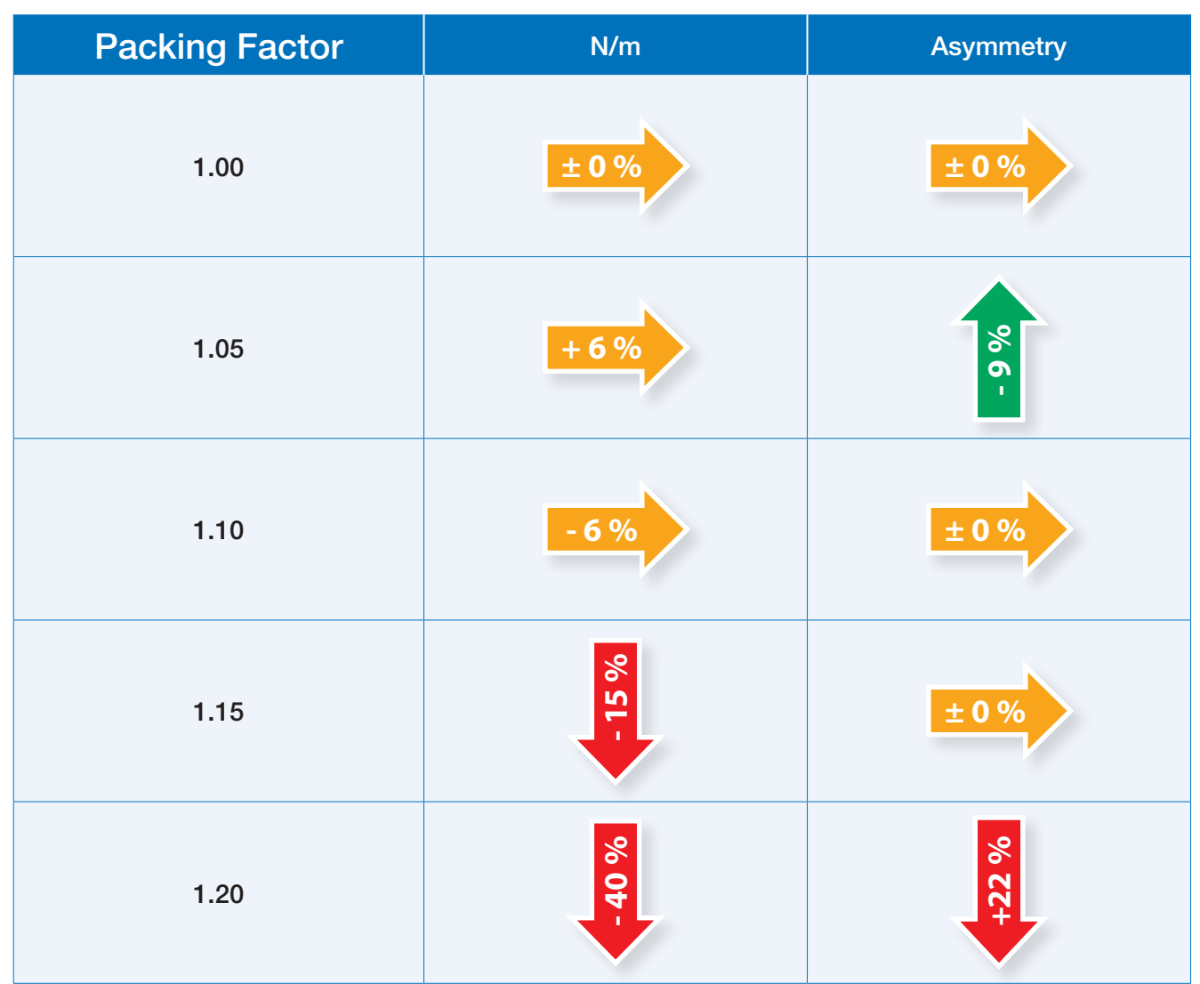
Table 3: Variation of Packing Factors, Packing Medium 1 M NaCl.

Conclusion: If compression is too strong, the column bed becomes inhomogeneous. This has a detrimental influence on plate count and asymmetry. The best results were obtained with a packing factor of 1.05.